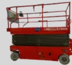
AERIAL-LIFT SCISSOR TYPE